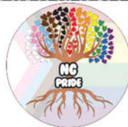
A RAINBOW WITH RURAL ROOTS